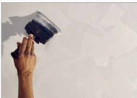
Step 5 - Second coat