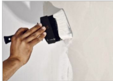
Step 4 - First coat