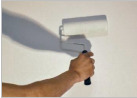
Step 1 - Start applying Primus Sabbia

Conservation: in a dry, cool place, away from the frost and humidity.