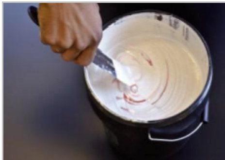
Step 3 - Mix the product until it's homogeneous