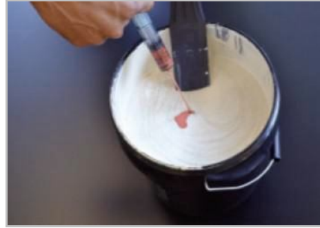
Step 2 - If necessary, prepare the shade with Gioia